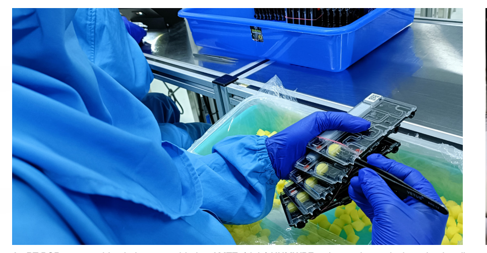
An RT-PCR test cartridge being assembled at AMTZ; (right) UHMWPE rods, used to make knee implant liners.

at a nominal rate to test his product before it heads to the TÜV-run facilities for more expensive compliance-level testing and certification. When he wanted an aesthetically pleasing, medical-grade plastic panel for the equipment to replace serviceable metal, he turned to a fellow incubatee.